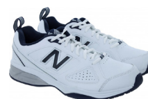
New Balance From £55.00 * Other New Balance trainers available